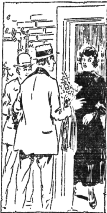
Found His Wife in Mourning.