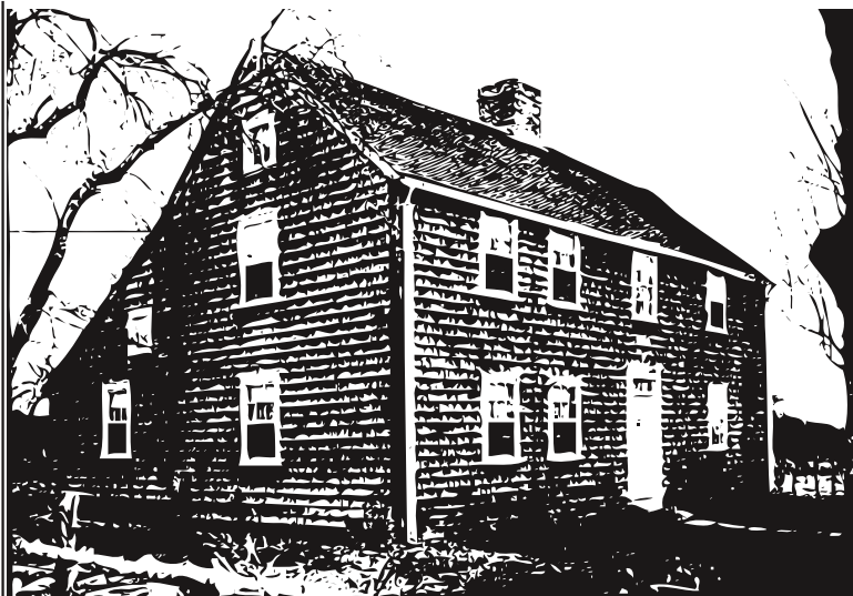
M.U. LITERARY HOUSE - Converted Farmhouse just outside of Ross's Corners.